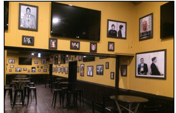
Site Survey Photo - 2 weeks after signed contract