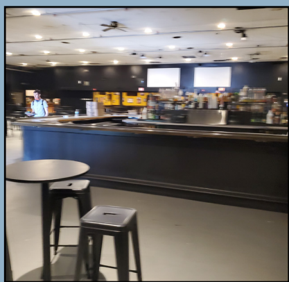
Site Survey Photo - performed three weeks after the initial call and two weeks after the signed contract.